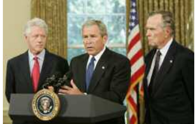
Standing with former Presidents Bill Clinton and George H. W. Bush, President George W. Bush discusses the plans to help people affected by Hurricane Katrina in the Oval Office Sept. 1, 2005. "We're working hard to repair the breaches in the levees. Federal, state, and local agencies are also cooperating to sustain life," stated President Bush. "That means getting food and water to those who are stranded. Medical personnel and local officials are helping hospital patients and people gathered in the Superdome to evacuate."

In the aftermath of Hurricane Katrina and her immense devastation, former Presidents Bush and Clinton established the Bush-Clinton Katrina Fund to provide relief and rebuild resources to help the victims of this disaster. This charitable fund will collect cash and in-kind donations and work with the governors of the affected states to coordinate both the short and long term relief efforts. Please go to www.usafreedomcorps.gov to learn more or, you can mail a check or money order to the addresses listed below. Please make checks payable to the "Bush-Clinton Katrina Fund".