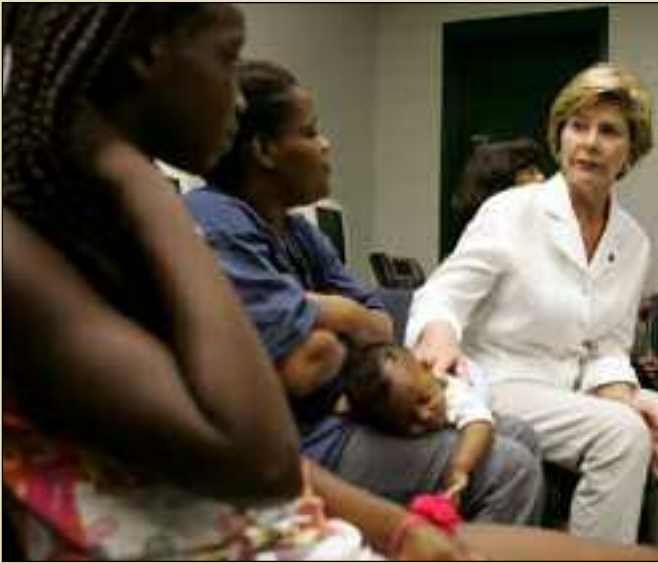
Laura Bush visits with people affected by Hurricane Katrina in the Cajundome at the University of Louisiana in Lafayette, La., Friday, Sept. 2, 2005.