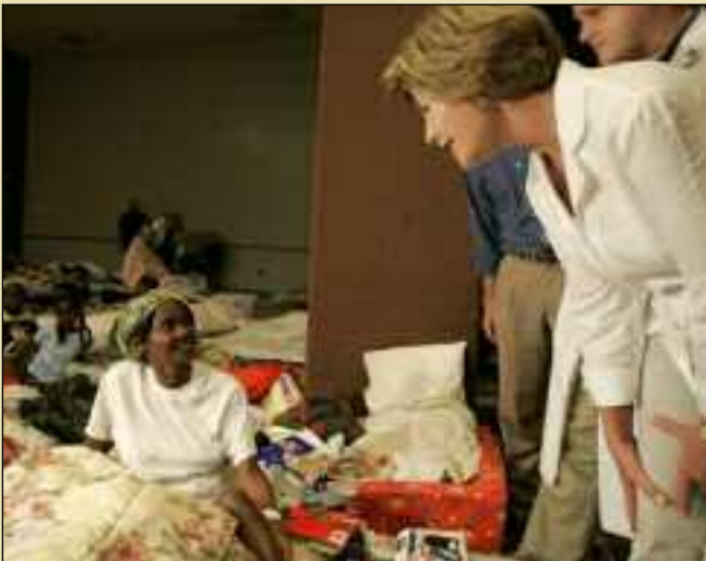
Laura Bush leans down to comfort a woman and her young child inside the Cajundome at the University of Louisiana in Lafayette during her visit to the center, one of many created to accommodate victims of Hurricane Katrina.