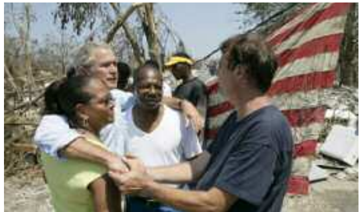
President George W. Bush embraces victims of Hurricane Katrina Friday, Sept. 2, 2005, during his tour of the Biloxi, Miss., area. The President told residents that he had come down to look at the damage first hand and to tell the "good people of this part of the world that the federal government is going to help."