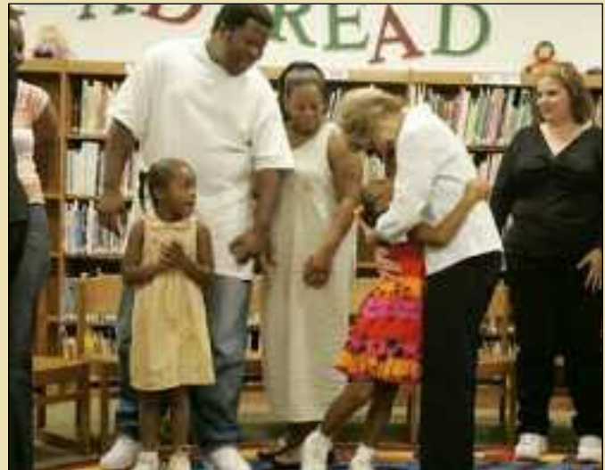
Laura Bush embraces a child Thursday, Sept. 8, 2005 of one of the families from New Orleans, displaced last week as a result of Hurricane Katrina, during a meeting at the Greenbrook Elementary School in DeSoto County, Miss. Greenbrook Elementary School has enrolled the most displaced students among the DeSoto County schools in Mississippi.