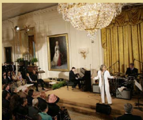
Patti Austin performs in the East Room of the White House at Black Music Month on June 26, 2006. She has performed for every President since Ronald Reagan.

—President George W. Bush, June 26, 2006