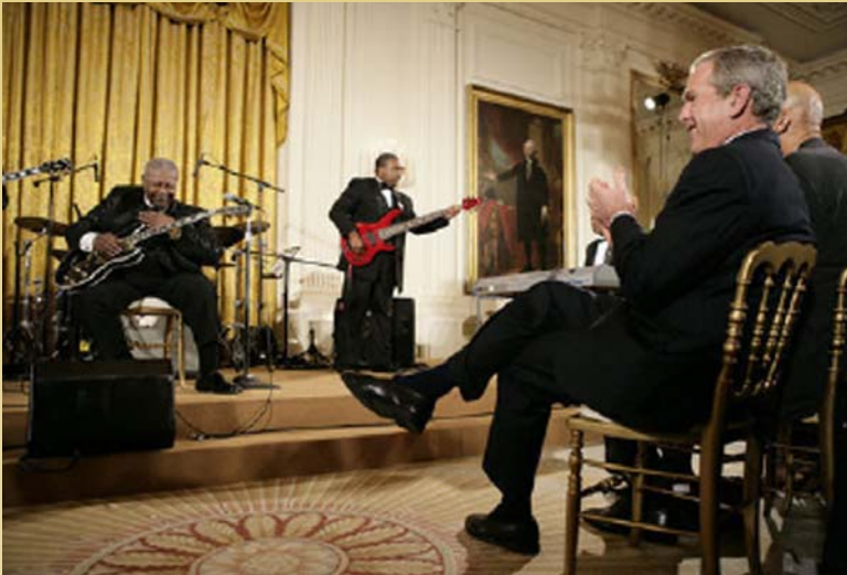
Legendary Blues guitarist B.B. King is applauded by President George W. Bush during King's performance in the East Room of the White House Monday, June 26, 2006, as part of the Black Music Month celebration focusing on the music of the Gulf Coast: Blues, Jazz and Soul.