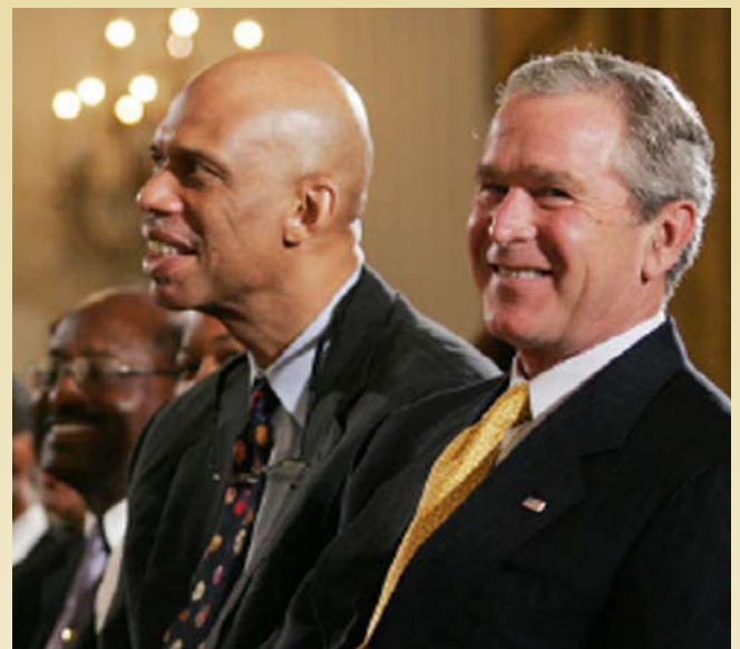
President George W. Bush is joined by basketball Hall of Famer Kareem Abdul Jabbar in the East Room of the White House Monday, June 26, 2006, as they listen to performer Patti Austin at the Black Music Month celebration focusing on the music of the Gulf Coast: Blues, Jazz and Soul.

—President George W. Bush, June 26, 2006