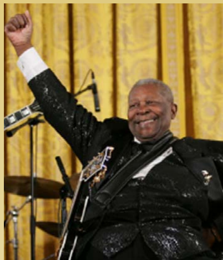
Legendary Blues guitarist B.B. King gestures at the end of his performance in the East Room of the White House Monday, June 26, 2006, as part of the Black Music Month celebration focusing on the music of the Gulf Coast: Blues, Jazz and Soul.

Harlem’s famed Apollo Theater. Since then, she’s recorded 16 solo albums, featuring everything from soul to standards.